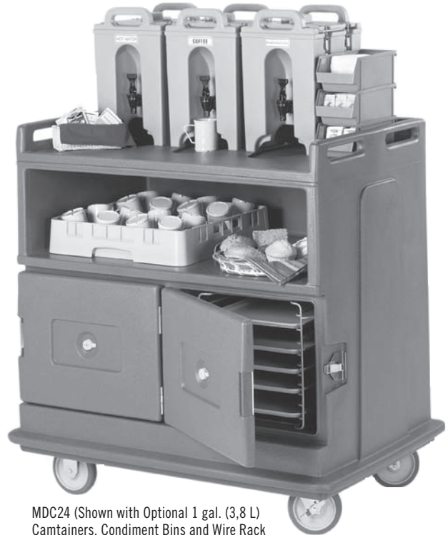
MDC24 (Shown with Optional 1 gal. (3,8 L) Camtainers, Condiment Bins and Wire Rack with Metric Camtrays)