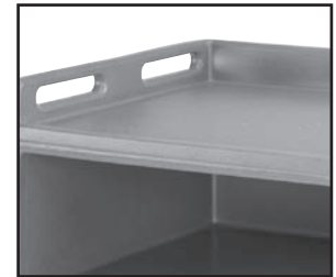
Model MDC24F has a flat top counter to allow menu service flexibility.