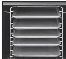
Organize Food Pans and Trays by placing the Optional Wire Rack inside the insulated compartments.