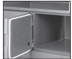
Closed compartments also hold supplies.